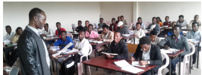
Top to Bottom: Group Photo in Church and GBI Compound, Pr Engida teaching "The Life of Christ", Dn Imane teaching "OT Survey"