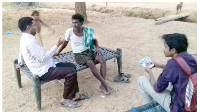
(Sharing the Gospel with the villagers)